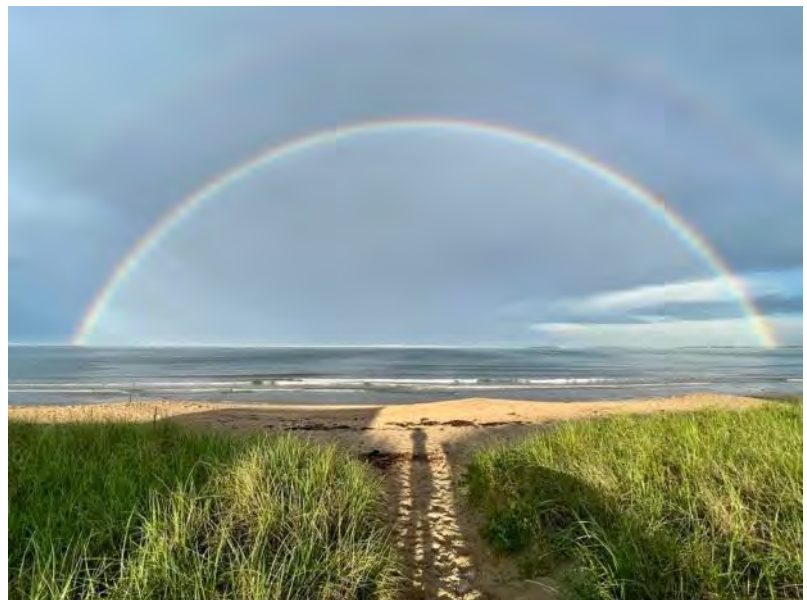
THANK YOU!

Our theme this year is “Come to the water; refresh your spirit.” I invite each of you to begin now to plan to come to the special waters in Ocean Park this summer and to begin even now, in anticipation of that journey, to refresh your spirit in anticipation of the relaxation, fellowship, education, spiritual nourishment and peace which our shared community offers. We are truly blessed to have Ocean Park as a beacon toward which we can guide our journeys.