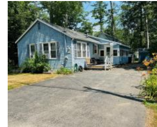
42 Mass. Ave. $1600/week plus tax