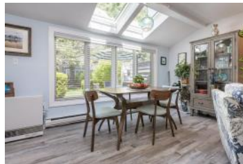
Unit 71 at Ocean Park Meadows $2500/week plus tax