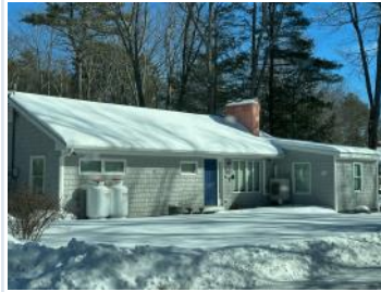
42 Free St. (coming soon) Rate TBD