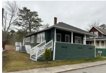
35 Randall $2300/week plus tax