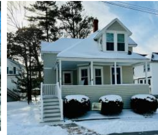
15 Oceana $3200/week plus tax